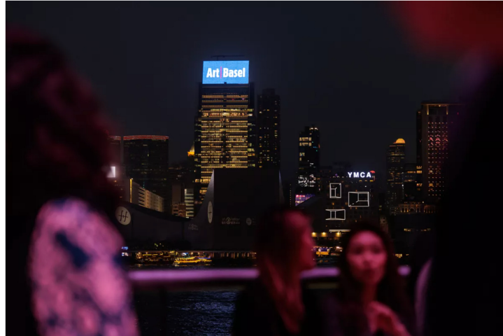
Art Basel Hong Kong signage.