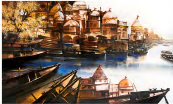
Artwork by Paresh Maity