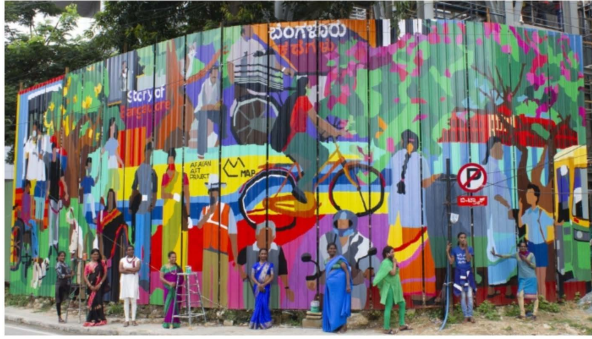
Artwork by Aravani Art Project