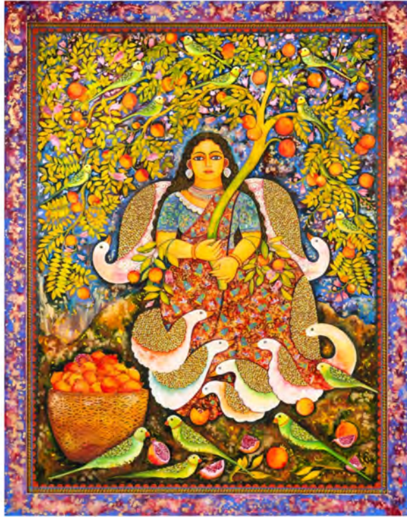
Artwork by Jayasri Burman

What to see: On the occasion of the gallery's 25th anniversary Art Musings exhibits work by stellar practitioners of distinctive approaches across generations, medium and vocabulary.