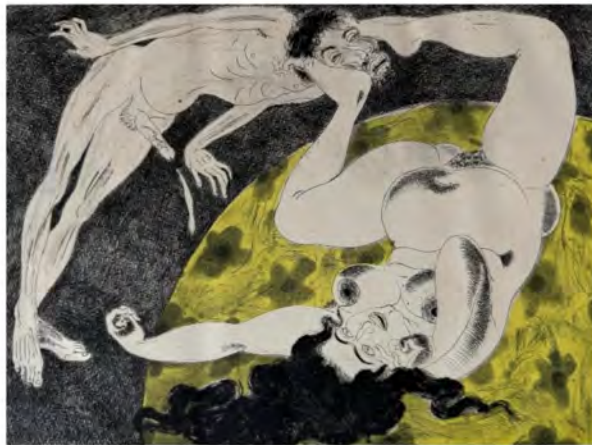
Artwork by T. Venkanna

What to see: The show deliberates on the artist's unflinching meditations on death and exploration of sexuality, drawing on Indian and European myths, archetypes and artistic traditions while situating the subject within the current sociological context.