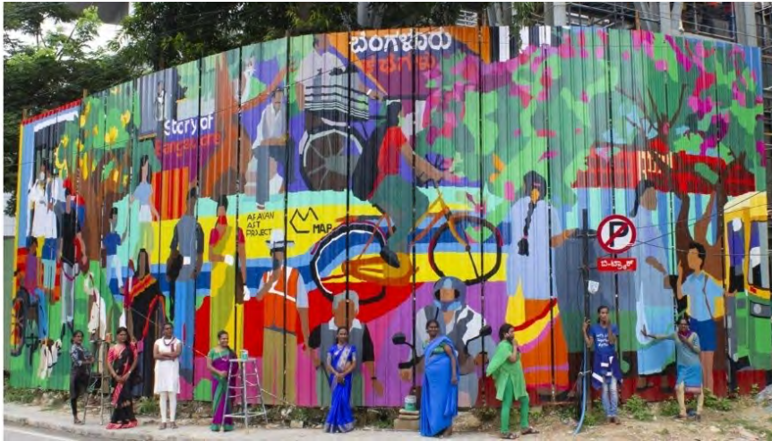
Artwork by Aravani Art Project at Gallery XXL

Why should designers care about art? Because art gives you a perspective of the cultural zeitgeist. It tells you what we value, our fears and sometimes how to eat a mushroom. Looking at you, Warhol. Want to challenge your perceptions? The 13th edition of Mumbai Gallery Weekend from 9th – 12th January 2025 presents the perfect opportunity.