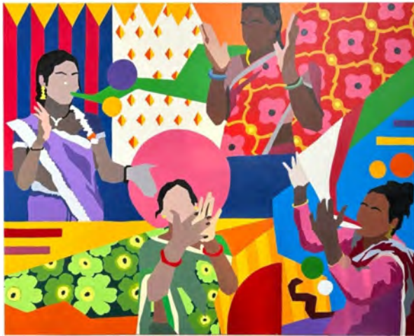
Artwork by Aravani Art Project