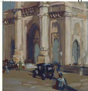
Gateway of India by J.D. Gondhalekar DAG Collection