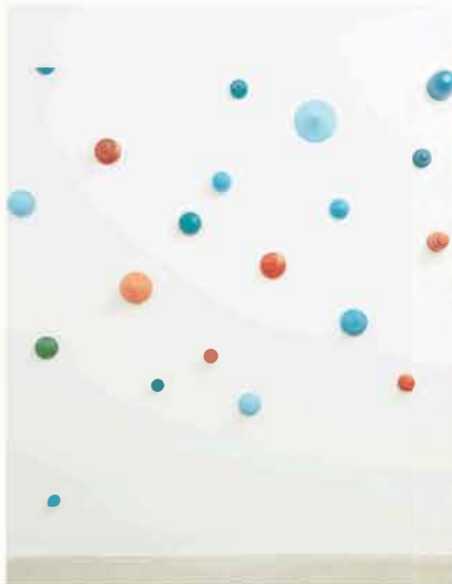
No. 874 by Rana Begum @ranabegumcontemporary

Araku, No. 1, Sunny House, Mandlik Rd, behind The Taj Mahal Palace, Apollo Bandar, Colaba