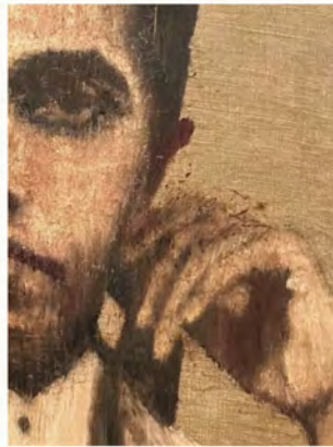
Untitled by Atul Dodiya Chemould Prescott Road