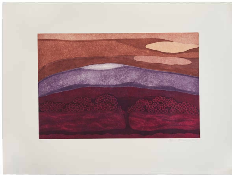
Soghra Khurasani, Fertile - 4 , 2024, etching print on Hahnemühle 300 gsm paper, print size: 19.5 x 29.5 in., paper size: 31.5 x 42 in., Edition of 5 + 1 A/P, © Soghra Khurasani, 2024, courtesy of Soghra Khurasani and TARQ

As the new year begins, Mumbai, India's bustling cultural capital, is poised to host the 13th edition of the Mumbai Gallery Weekend (MGW) . From 9 to 12 January 2025 , MGW transforms the city into a dynamic hub for art enthusiasts, collectors, and connoisseurs, bringing together over 35 leading galleries in a celebration of contemporary art. With its combination of landmark exhibitions, guided walkthroughs, artist talks, and panel discussions, MGW cements Mumbai's position as a pivotal force in the global art ecosystem.