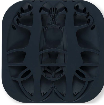
Amba Sayal-Bennett, See# Coat , 2024, SLA, Resin, 12.1 x 12.1 x 2.9 inches.

ASB: In the sculptures, I have reworked botanical illustrations from historical texts like Carl Linnaeus' Systema Naturae , blending and overlaying them to subvert traditional taxonomy. By merging these markers of difference, I aimed to challenge the idea of classification. I have been influenced by Sara Ahmed's writings on use, particularly her discussion on how the demand to use something properly can be seen as a demand to revere what has been given. I view my misuse of the drawings as an act of disobedience—a refusal to enact a prior history of use.