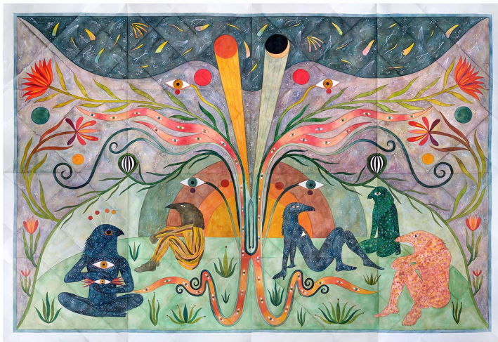
© Rithika Merchant / India b.1986 / Temporal Structures 2023 / Gouache, watercolour and ink on paper / 105 × 150cm / Courtesy: The artist and TARQ, Mumbai / ● Rithika Merchant

Queensland Art Gallery and the Gallery of Modern Art's 11th Asia Pacific Triennial of Contemporary Art (APT11) will run from Saturday, November 30, 2024–Sunday, April 27, 2025. For more information, head to the GOMA website .