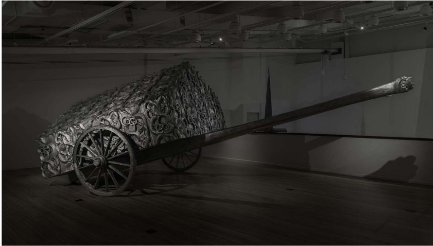
© Brett Graham / Ngāti Korokī/Kahukura, Tainui / Aotearoa New Zealand b.1967 / Maungarongo kite Whenua, Maungarongo kite Tangata 2020 / Wood, synthetic polymer paint and graphite / 320 × 800 × 320cm / Courtesy: The artist and Neil Pardington / © Brett Graham and Neil Pardington / Photograph: Neil Pardington.

The full roster of APT10 participants spans artists from Australia, New Zealand, Japan, Iran, India, Singapore, Hong Kong, China, Papua New Guinea, Taiwan, Timor-Leste, Saudi Arabia, Sri Lanka, Fiji, Malaysia, Vietnam, Hawaii, South Korea, Mongolia, Indonesia, Tonga, Uzbekistan, Thailand, Solomon Islands, The Philippines, Samoa, Bangladesh, Pakistan, Vanuatu, Cambodia, the US and more.