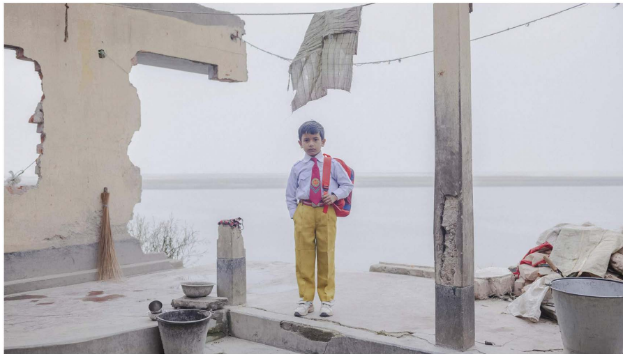
© Sarker Protick / Bangladesh b.1986 / স্মরণ, Of River and Lost lands' (detail) 2011–ongoing / Inkjet print on paper / 50.8 × 76.2cm / Courtesy: The artist and Shrine Empire, Delhi / © Sarker Protick.