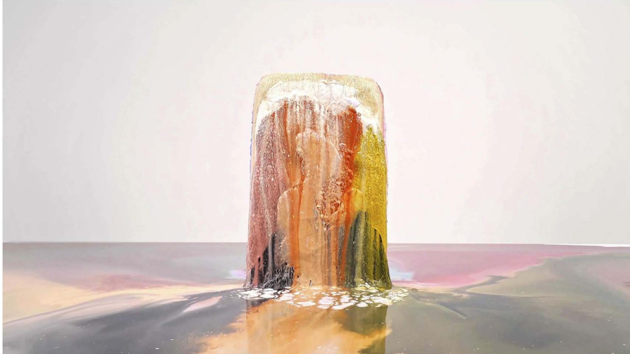
● Dawn Ng / Singapore b.1982 / WATERFALL VIII (still) 2023 / 4K video: 16:9 (landscape) and 9:16 (portrait), 27:06 minutes / Courtesy: The artist and Sullivan+Strumpf / ● Dawn Ng.

Thailand's Mit Jai Inn is bringing a maze-like piece to the QAG Waterfall, a space that's also seen its fair share of part works — including from Yayoi Kusama and at prior APTs — and featured on-screen in Apples Never Fall . This time, art lovers will spy tunnels, curtains and scrolls, all in an installation that you can step inside. There's your first must-see part of APT11 .