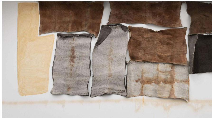
© D Harding / Bidjara, Ghungalu and Garingbal people / Australia b.1982 / Wool blankets (installation view, 'We Breathe Together', Bergen Kunstall, Norway) 2021–22 / Wool felt, pigment, gum arabic / Courtesy: The artist and Milani Gallery, Brisbane / © D Harding / Photograph: Thor Brødreskift.