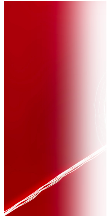
Rithika Merchant, Temporal Structures 2023. Gouache, watercolour and ink on paper, 105 x 150cm.